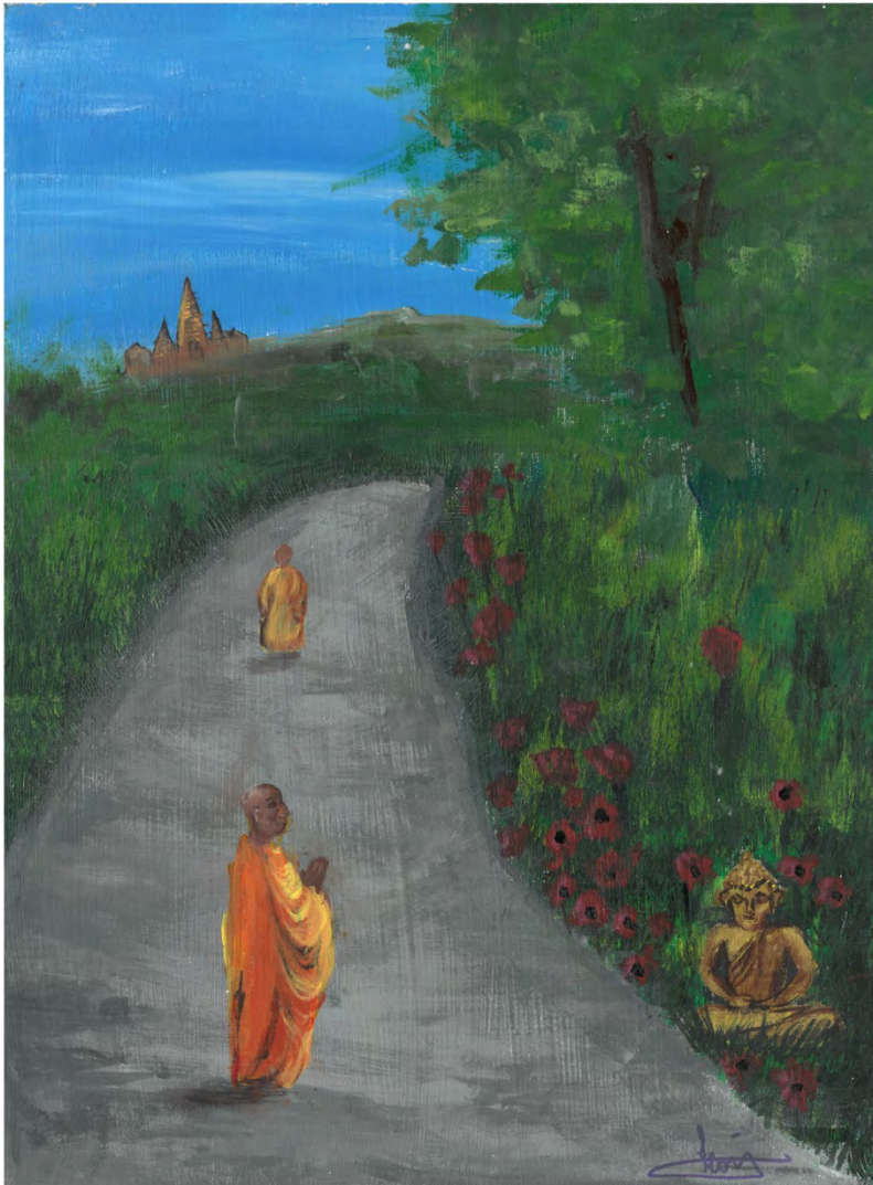
Leonie, aged 13