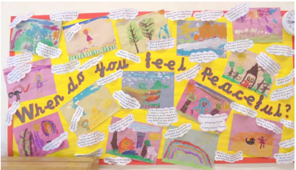
Reception/Y1 reflect on when they feel peaceful.